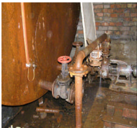
Figure 2: Cooling water collection tank