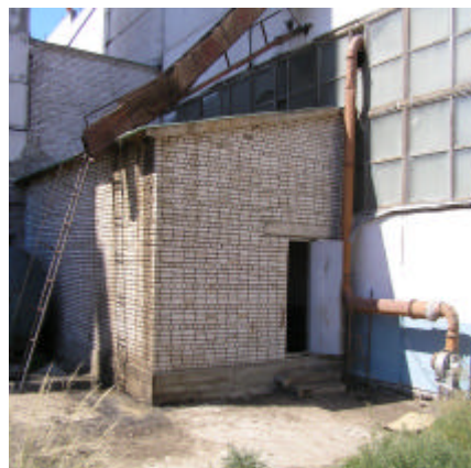
Figure 3: Additional small building for cooling water collection tank