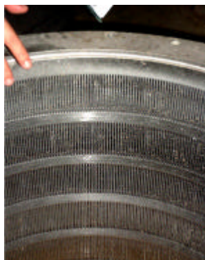
Milled Screen Cylinder, 0.35 mm.

After investigating new technologies and new designs of Approach Flow Screens, the C-Bar Screen Cylinder with 27-blades Multi-Foil Rotor was found, which consumed less power but increased the sticky removal rate.